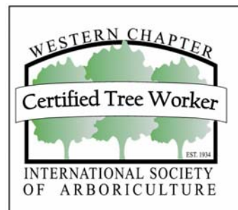
Hard Hat Decal