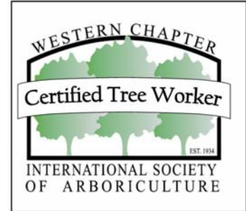
Hard Hat Decal